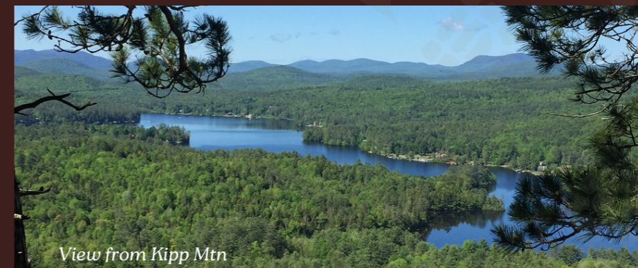
View from Kipp Mtn

**Please note that some of these trails are closed during Hunting Season; see trailhead for more information.