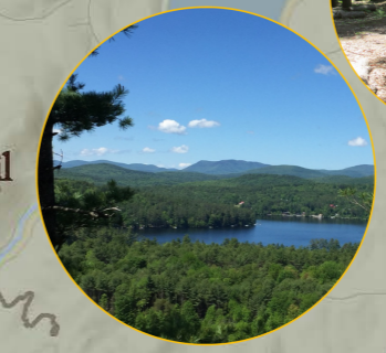
1 Stewart Mtn Trail