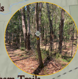
4 Cougar Nature Trails