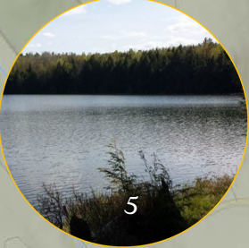
5 Palmer Pond Trail