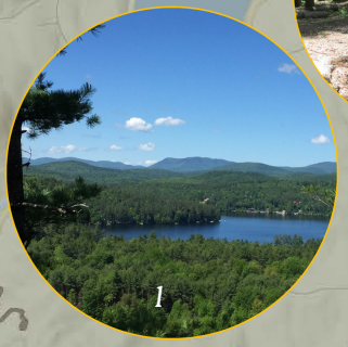
1 Stewart Mtn Trail