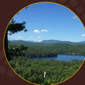
1 Stewart Mtn Trail