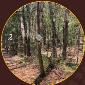
3 Catamount Mtn & Green Hill Trails