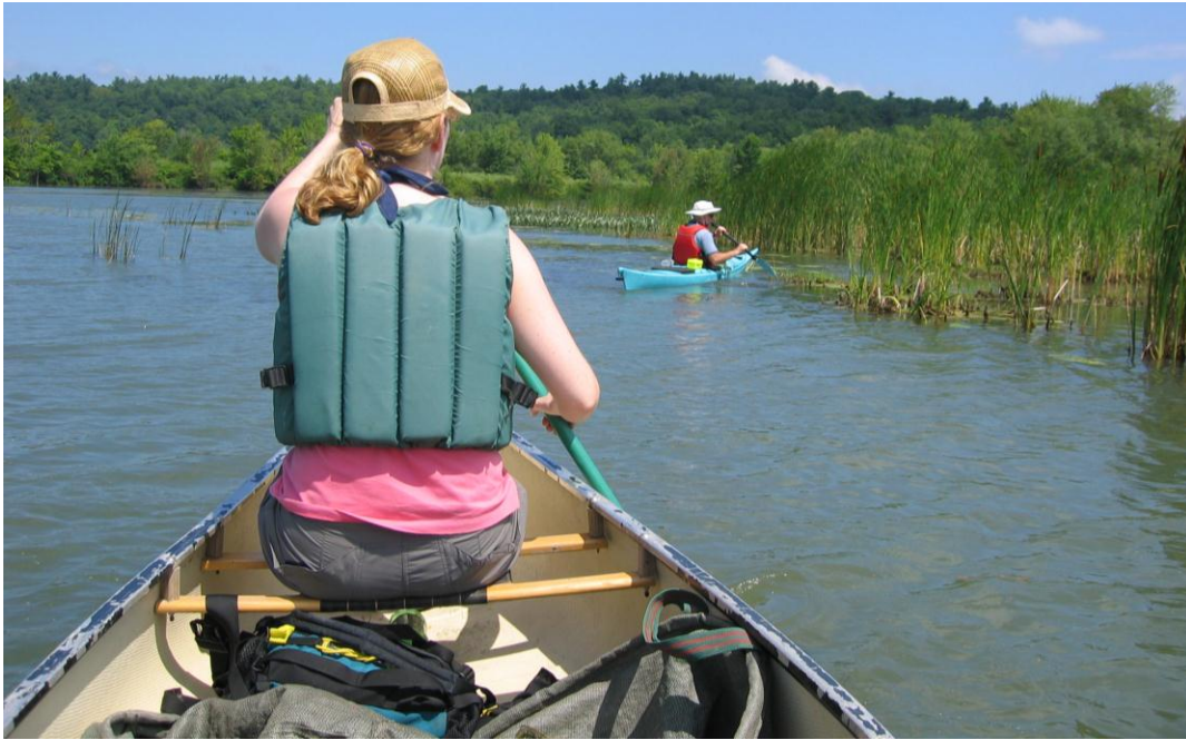
Volunteers throughout the CVNHP region work to reduce the impacts of invasive species.

to watershed management for invasive species serves as an example for other basins around the world. The process of developing interstate, international, and interagency plans to address significant environmental issues allows actions to occur more quickly. The Lake Champlain Basin Aquatic Nuisance Species Rapid Response Plan provides the opportunity to avoid catastrophic expenses associated with invasions of nuisance species that pose ecological and economic harm to the region.