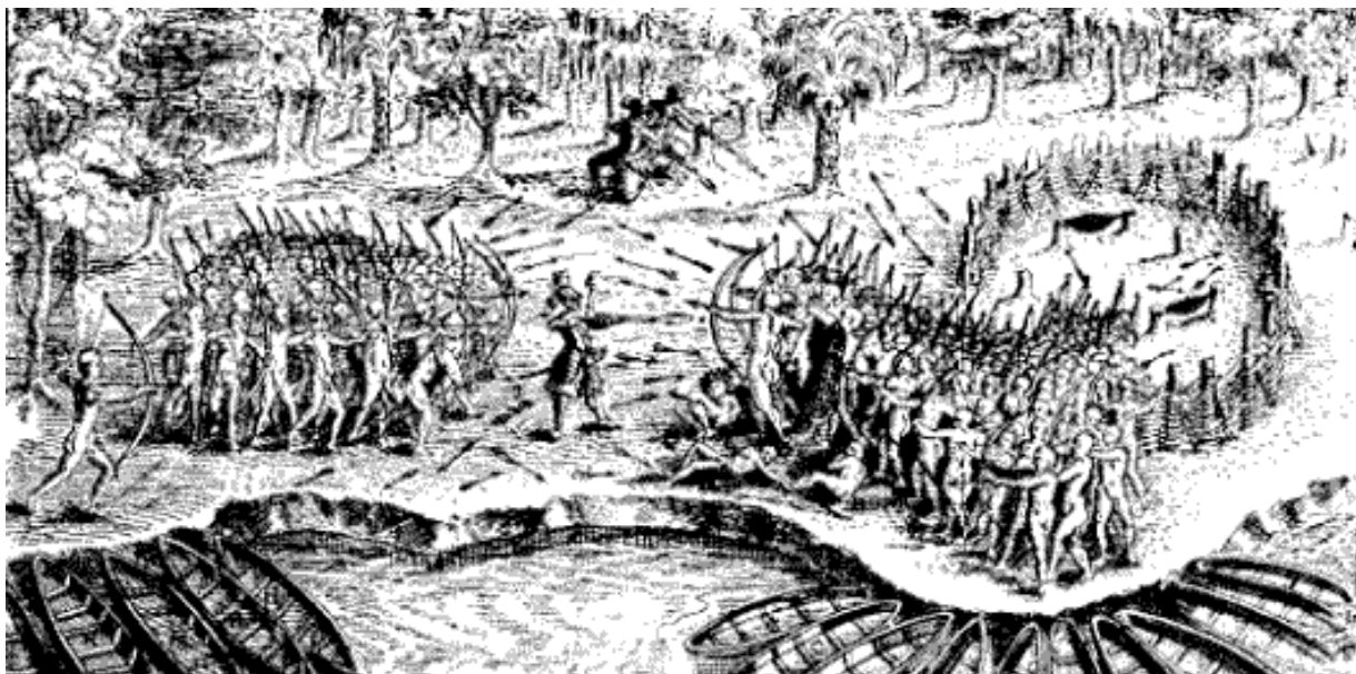
Samuel de Champlain's 1609 battle with the Iroquois formed a Franco-Algonquin alliance that lasted 150 years.

Archeological evidence indicates that humans arrived in the valley not long after the retreat of glacial ice, living in a tundra-like environment still influenced by the nearness of the ice sheet. Thereafter, native cultures passed through the stages of development characteristic of eastern North America, so that the Woodland culture prevailed when Europeans arrived early in the 17 th century. At that time, the eastern side of the lake was inhabited largely by Western Abenakis. Mohawks, members of the Iroquois Confederacy, lived across the lake, and Mahicans inhabited the southern portion of the region. There were exceptions to this pattern, but generally the lake acted as a demarcation line between the Abenakis and the Iroquois. The Abenaki name for the lake, Bitawbagok, which translates as “the waters between,” suggests that this was a long-standing situation. This division, with its resultant insecurity, may explain why the valley was not inhabited as densely as its resource potential would suggest.