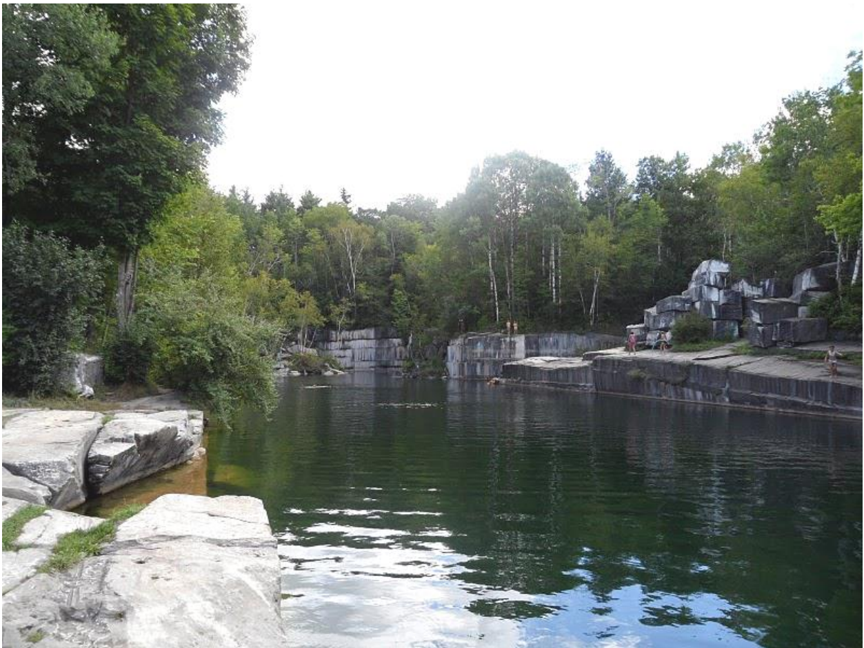
Historic quarries have become swimming holes in some parts of the CVNHP region.

Many recreational programs are bi-state in nature. Lake Champlain Bikeways provides information on a 1,300-mile network of bicycle routes in the Champlain Valley. A large segment of the Northern Forest Canoe Trail—a water route that follows a historic east-west Native American trading route from Old Forge, New York, to Port Kent, Maine—is located in the northern portions of the CVNHP. The Lake Champlain Birding Trail and the Lake Champlain Underwater Preserve System have sites in Vermont and New York.