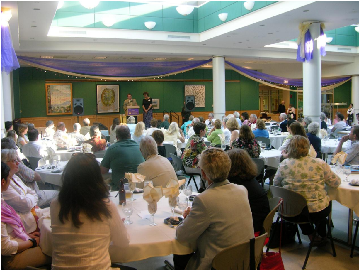
Public outreach for the CVNHP planning process began in March 2008

stewardship and education programs during commemoration events. The Discover 1609 voyage was supported by the LCBP with funds from both the EPA and NPS; additional support was provided by businesses and individual donors. The voyage also received a significant amount of LCBP technical support, including several LCBP employees serving on board, sharing their interpretive knowledge and publications concerning the environmental condition of Lake Champlain with the 25,000 visitors who boarded the vessel.