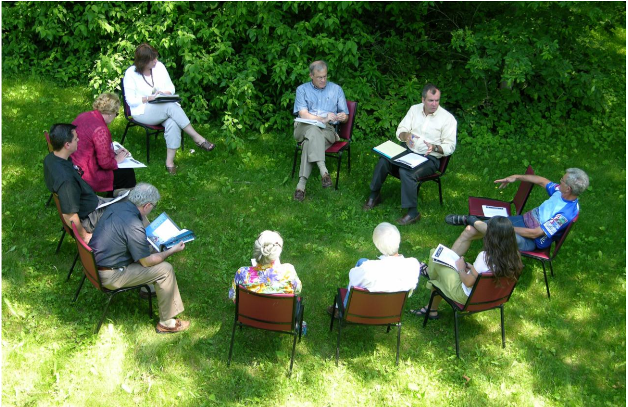
The Heritage Area Program Advisory Committee meets 4-5 times a year.