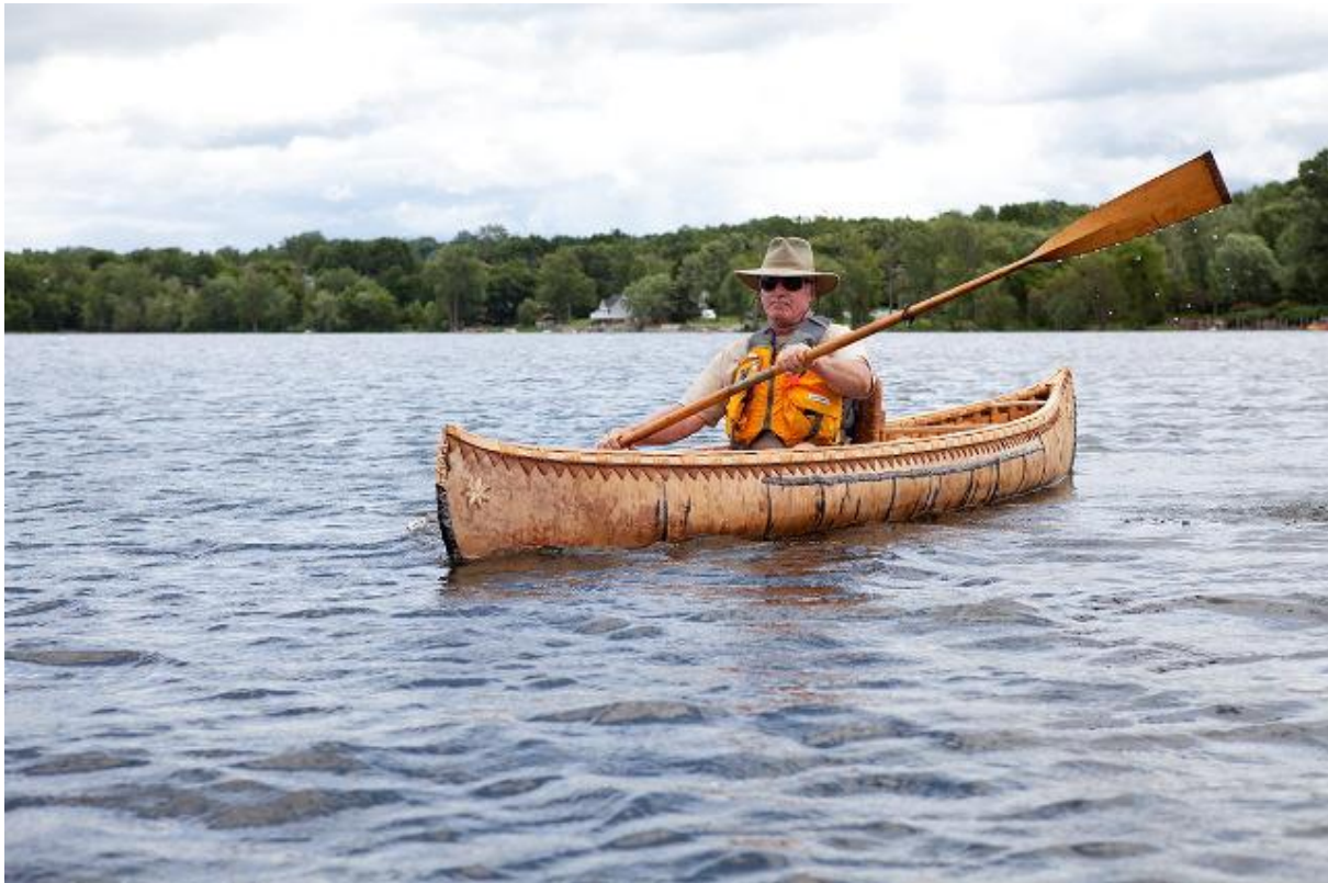
Padding a birch bark canoe along the Shelburne Bay Interpretive Water Trail .

Objective: To have a well informed public that values the unique heritage of the CVNHP and understands the threats to those resources.