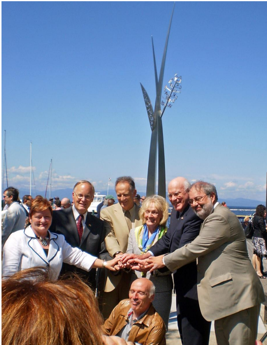
The success of the CVNHP relies on strong, cross-border partnerships.

All partnerships require four basic elements: an eligible organization, an agreement to work on an implementation task resulting in a specific outcome, partner professionalism, and task completion. Partnerships are established to bring together two or more parties to achieve mutual benefits. While written agreements are important, successful partnerships rely from the outset upon trust and professional goodwill between the collaborating partners. These collaborations help the partners involved reach their goals more effectively in the communities they serve.