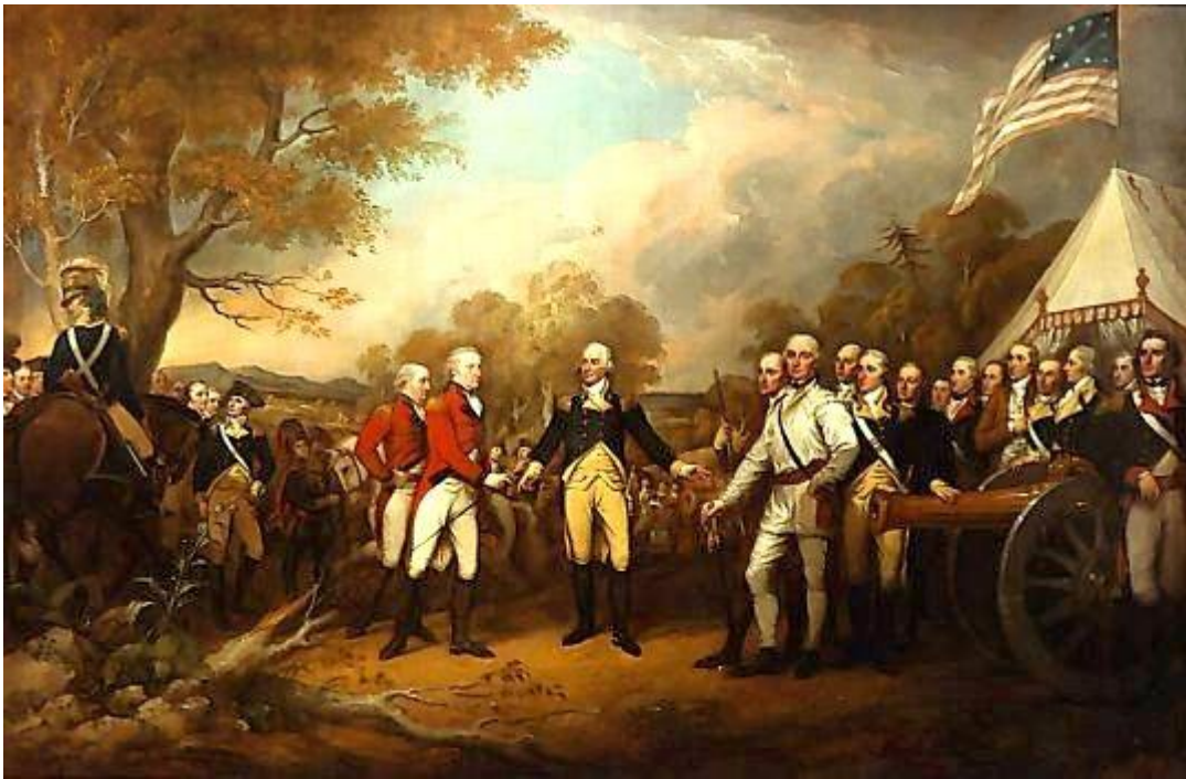
The Battle of Saratoga—the turning point of the American Revolution—occurred in the southern portion of the CVNHP