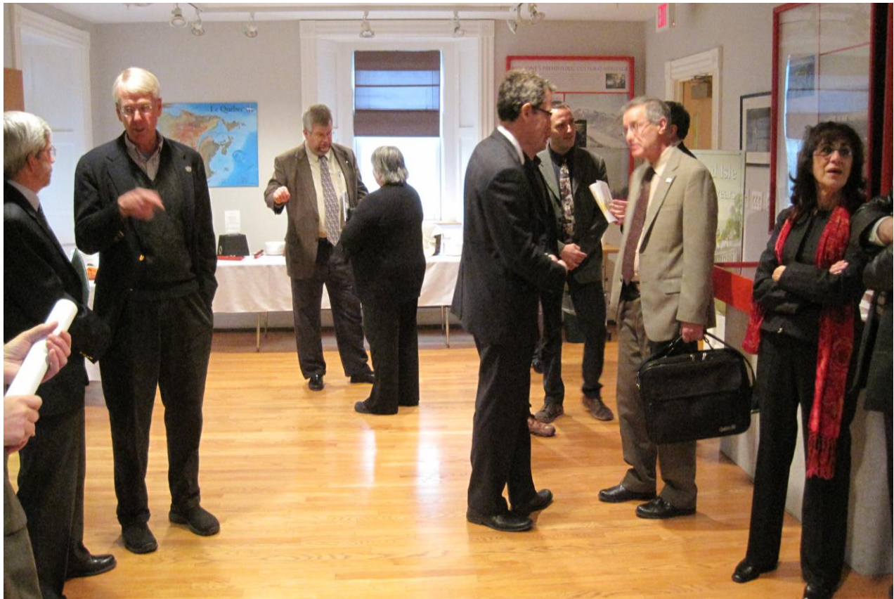
State, federal, and local partners attend the November 2010 official signing of Opportunities for Action