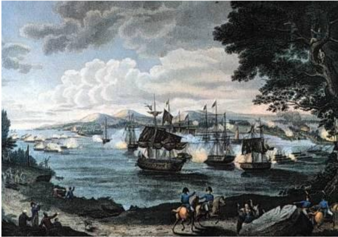
The 1814 Battle of Plattsburgh was the last time two English-speaking navies engaged in combat. Painting by H. Reingale, engraved by Benjamin Tanner, 1816.