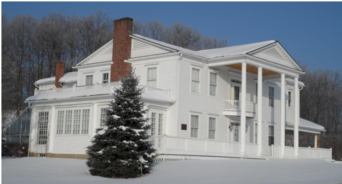
Historic homes and buildings can be found throughout the CVNHP

Historic buildings, structures, complexes, districts, and communities constitute the most widely recognized and documented heritage resources in the CVNHP. Many historic buildings are used for functions of government, worship, education, community, and commerce. These historic buildings are the most accessible to the public and most easily lost to deterioration, demolition, fire, redevelopment or other pressures. There are 23 National Historic Landmarks within the CVNHP and approximately 650 properties listed on the National Register of Historic Places.