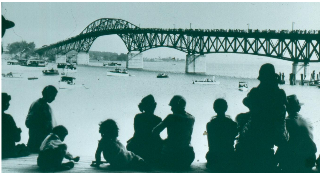
The Champlain Bridge opened in 1929

Lake Champlain commerce survived into the middle of the twentieth century by carrying bulky cargoes within the Champlain Valley and transporting fuel oil, kerosene, and gasoline to the largest lake towns and cities. In an effort to stimulate lake commerce and activity on the Champlain Canal, the State of New York decided to enlarge the lock size to accommodate larger vessels by 1916. The state had assumed that enlarging the size of the vessels would reduce the cost of shipment, and provide a greater cost effectiveness of water transportation relative to the railroads. The new lock dimensions, however, exceeded the practical size for a shallow-draft wooden vessel. Commercial wooden ships had largely become obsolete by the 1920s, when wooden shipbuilding yielded to the construction of iron or steel vessels.