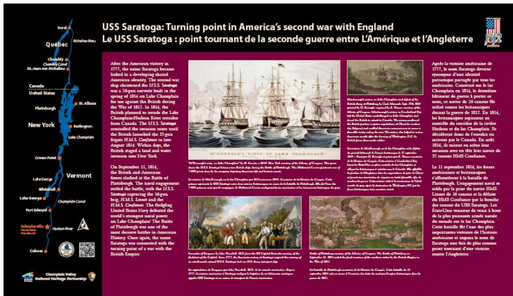
A War of 1812 Interpretive Trail Wayside Exhibit