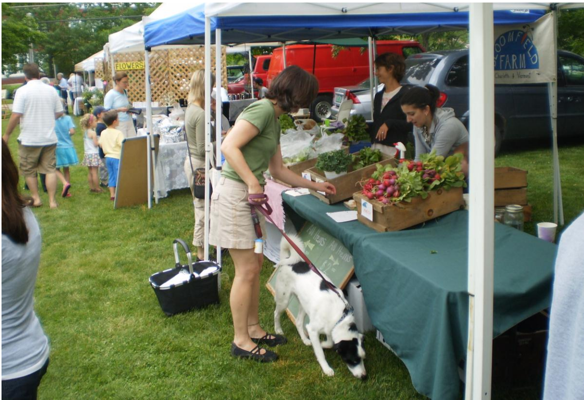
Farmers Markets are an important part of the modern social fabric of the CVNHP

Archeological evidence concurs with Champlain's reports. Native people farmed the rich soils of the valley long before the 17 th century. Early European settlers later cleared far more of the land and established farms from the Lake Champlain and Upper Hudson River to the mountain slopes, both to the east and the west, by the early 1800s. Much of this agriculture was not sustainable and died out in response to changing economic markets by the late 19 th century. Some of the practices (such as clear cutting forests followed by overgrazing) were highly detrimental to the landscape. By the late 19 th century, summer vacationers and local residents began to better understand the environmental consequences of this degradation, resulting in some of the earliest environmental conservation efforts in the United States.