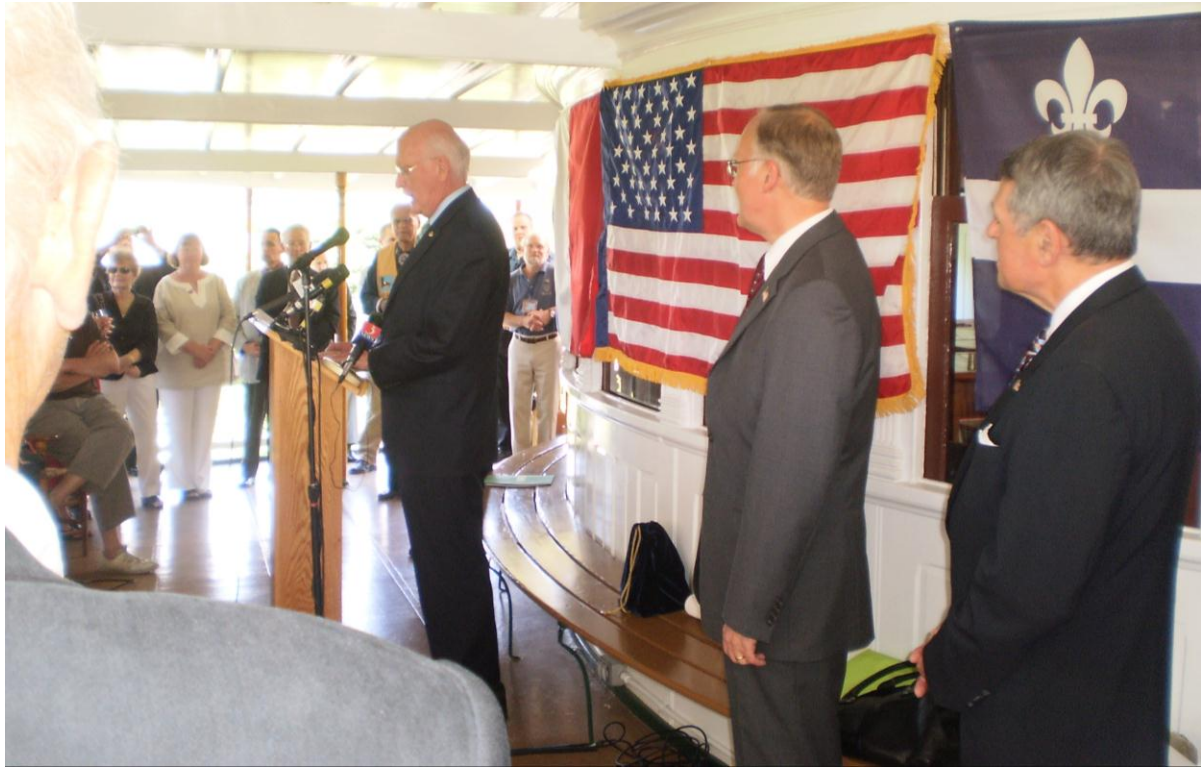
The Quadricentennial strengthened relationships between the United States, Quebec and France.