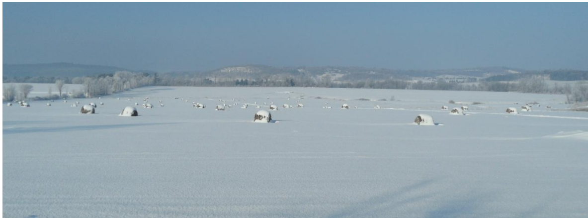
Winter in the Champlain Valley.