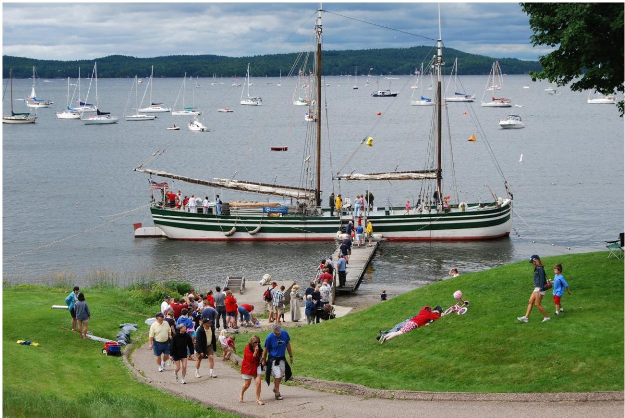
The Lake Champlain Maritime Museum built the replica canal schooner Lois McClure from measurements of similar vessels shipwrecked in Burlington Bay.

The CVNHP contains the best collection of preserved, submerged, freshwater cultural heritage resources in North America. Many of these are shipwrecks offering unique opportunities for research, interpretation, heritage tourism, and recreation for current and future generations. However, some of these irreplaceable cultural heritage sites are threatened by overuse by divers, neglect, and aquatic invasive species. Zebra mussels, which were discovered in Lake Champlain in 1993 and in Lake George in 1999, arrived in the region via the Champlain Canal and are now widespread. According to the 1996 report, Zebra Mussels and their Impact on Historic Shipwrecks (LCBP, 1996), these prolific, razor-sharp mollusks can cover historic shipwrecks and artifacts to depths of up to 50 feet. The weight of the mussel colonies can crush wooden shipwrecks. Also, their excrement corrodes the iron fastenings of shipwrecks, causing structures to collapse. Quagga mussels, which have been found in the Great Lakes and St. Lawrence River, are a similar threat to the underwater artifacts of the CVNHP. However, Quagga mussels are more tolerant of a greater range of temperatures and depths, posing a greater danger of impact to deep-water shipwrecks.