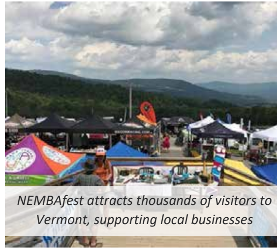
NEMBAfest attracts thousands of visitors to Vermont, supporting local businesses

Kingdom Trails benefit from a partnership with the Burke Mountain ski resort that has extended its season because of the new opportunities.