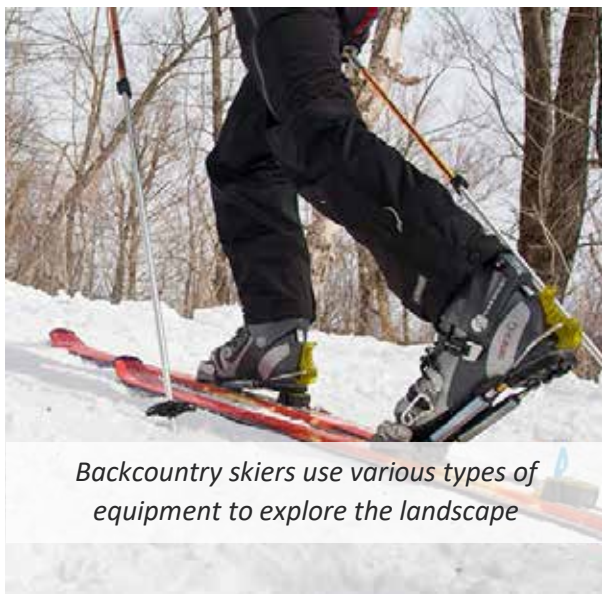
Backcountry skiers use various types of equipment to explore the landscape

Developing and enhancing outdoor recreation opportunities is, at its core, a community development initiative. Outdoor recreation is often leveraged for its ability to draw outside spending into the community. However, trails and recreational facilities also benefit existing residents by providing opportunities for