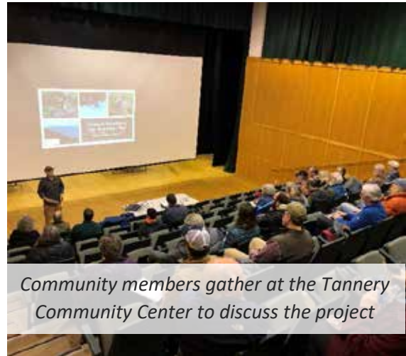
Community members gather at the Tannery Community Center to discuss the project

The project team conducted extensive site visits to evaluate the condition of existing trails, inform the type and location of improvements, and determine the most appropriate routing of new trail connections.