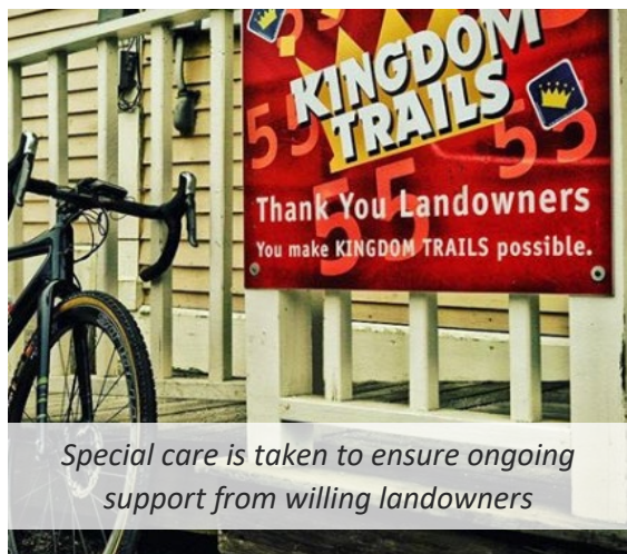
Special care is taken to ensure ongoing support from willing landowners