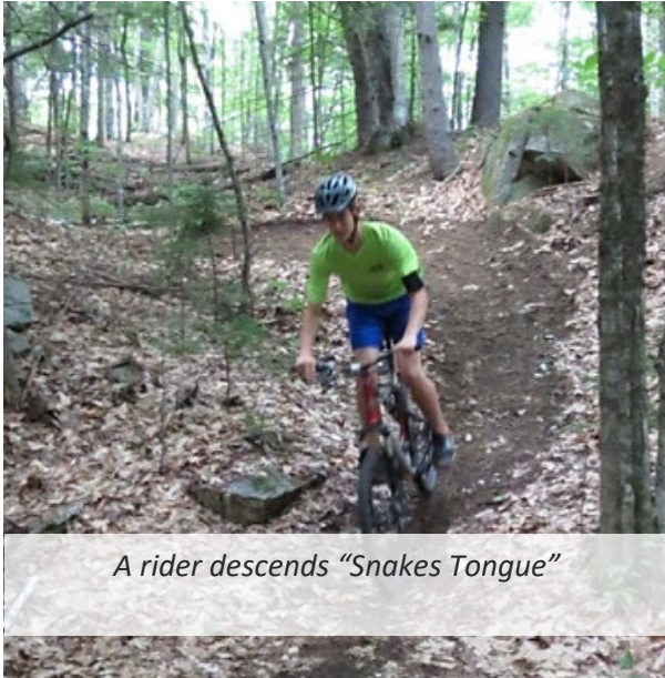
A rider descends "Snakes Tongue"

Adirondack trails are becoming victims of their own success as increasing numbers of visitors are using old or improperly designed trails. Purpose built trails are intended to withstand