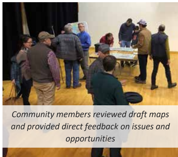
Community members reviewed draft maps and provided direct feedback on issues and opportunities