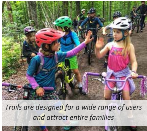
Trails are designed for a wide range of users and attract entire families