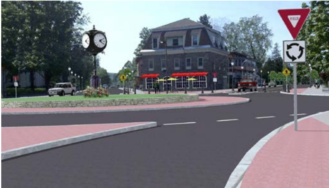
Proposed Roundabout at 5-way intersection.

The NY Forward project area contains a mix of complementary shovel ready projects that are intended to catalyze further private investment along the entirety of Main Street. While there are many other