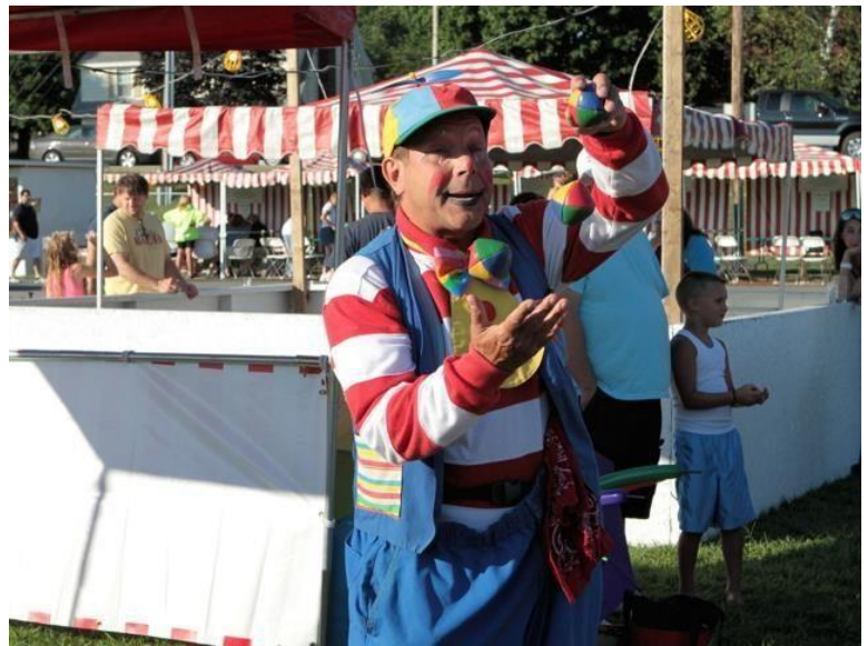
Family fun at the Smoke Eaters Jamboree

Local businesses make up the heart and soul of Warrensburg, and shops like Oscar's Smokehouse and Jacob and Toney's Meat Store of the North provide a reason for people to stop in Warrensburg on their way to skiing or vacationing elsewhere in the Adirondacks.