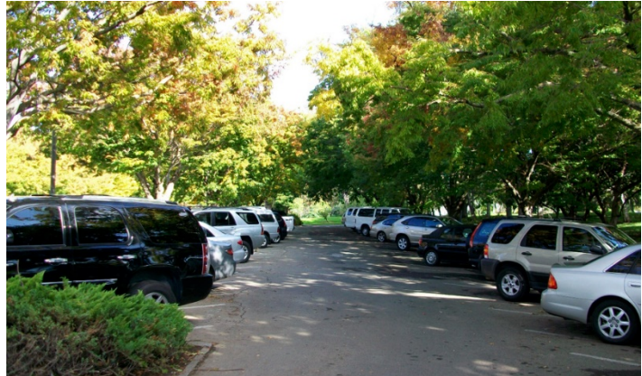
Example of Attractive Shared Parking Lot