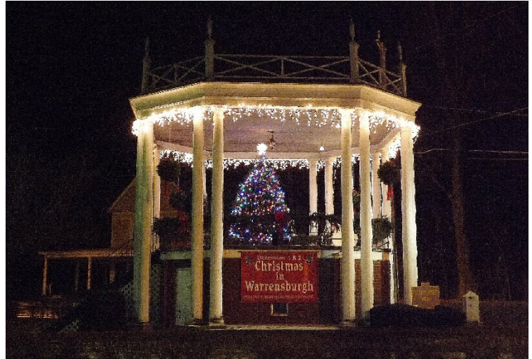
Town of Warrensburg's Bandstand

Warrensburg is a complete community ready to share in the growing prosperity spreading north from the Capital Region via Tech Valley, Saratoga Springs, and Glens Falls. But unlike other communities that stand to grow at the expense of the very people, businesses, and history that have shaped it, Warrensburg is ready for growth and revitalization on its own terms. Through decades of careful stewardship, the Town of Warrensburg has navigated the regional and national trends shaping our communities. Strategic investments by the Town in infrastructure, emergency services, public parks, and community health facilities have allowed Warrensburg