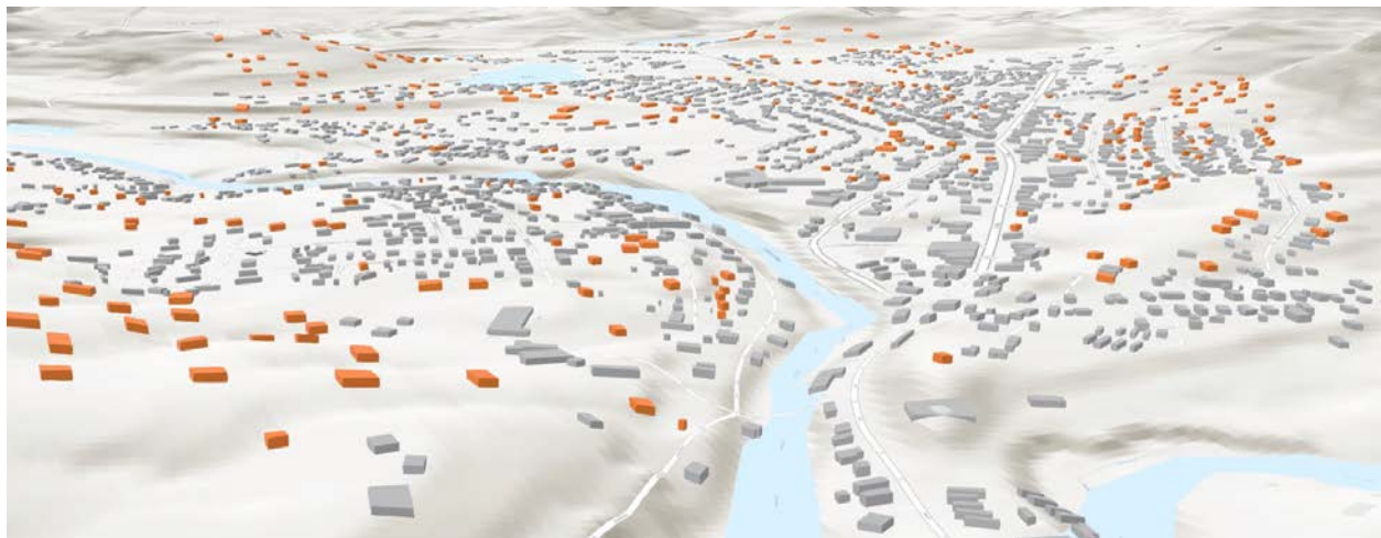
3D map of Potential Housing Units in the Town of Warrensburg, from the Buildout Analysis completed by Warren County GIS.

-Resident's vision for Warrensburg from 2022 EDC Survey