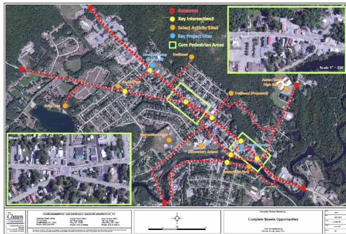
Warrensburg's Complete Street Opportunities Map (2012)

The NY Forward project area includes the 5-way intersection at the center of Town which once served as Warrensburg's primary civic space. The intersection of Main, Elm, Hudson, and Adirondack Ave hosts the Floyd Bennet Park and Bandstand and previously was home to a public fountain. Today, this area has as many vacancies as it does active commercial spaces and residential units. The 13,000 vehicles passing by on a daily basis are keenly aware of the empty storefronts in Warrensburg's main commercial center. But, the financial challenges of retrofitting historic properties to modern standards in a contextually sensitive manner has stymied properties from reaching their full potential. While this the case in other portions of Warrensburg and other portions of Main St., targeted investment here will have the most transformative effect. Not only are their many opportunities for improvement, but here the surrounding property owners are committed to making ongoing investments if there is some financial investment from New York State. The high visibility of this area, the number of potential retail spaces, and the number of potential residential units that can be restored or created is unmatched elsewhere in Warrensburg or anywhere else in rural Warren County.