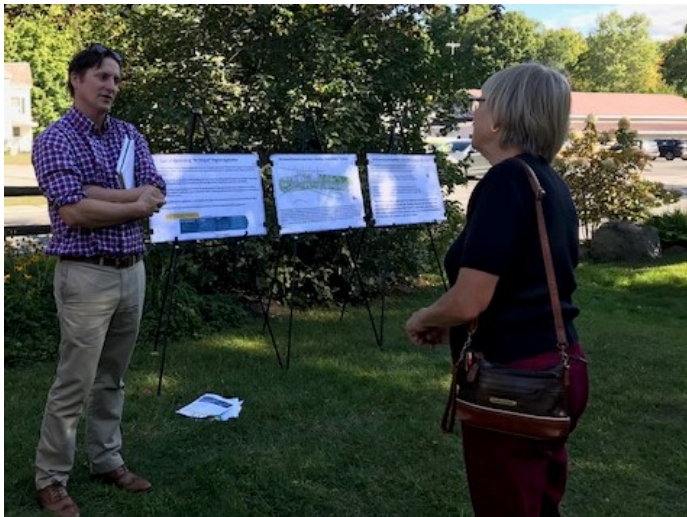
Discussing the NY Forward Application at the 2022 Apple Festival

"I have lived in Warrensburg for 32 years. My vision for Warrensburg is a community that values and preserves our historic buildings, structures and landmarks as well as our parks and open spaces. I would like our town to support our current businesses and recruit local small businesses. I would like our town leaders to seek input from and listen to Warrensburg citizens. I support more beautification projects which enhance our town and improve the quality of life for our residents. I would like to see the walkability of Warrensburg maintained and improved. Being able to walk for errands and exercise has health, economic and environmental benefits." -Resident comment in 2022 EDC Survey