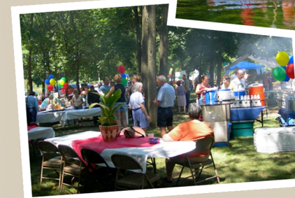
Visit www.feedercanal.org for exact dates.