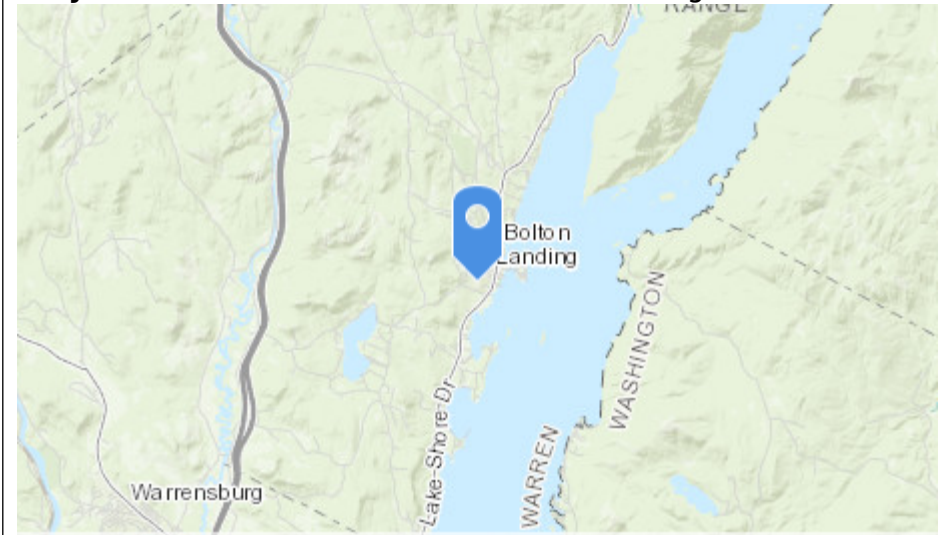
Esri Canada, Esri, HERE, Garmin, USGS, NGA, EPA, USDA, NPS Powered by Esri