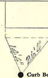
● Curb Box