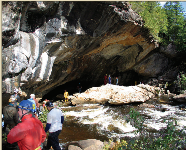
Cavers explore the largest marble cave entrance in the eastern USA at Natural Stone Bridge & Caves.