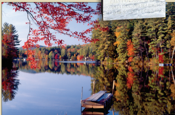
Peaceful fall serenity on Loon Lake.