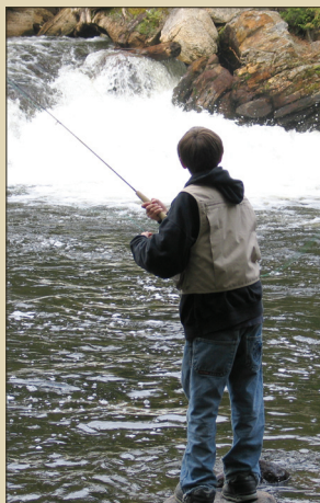
Fishing on Trout Brook, clear waters flowing into Schroon River and on to the Hudson River.