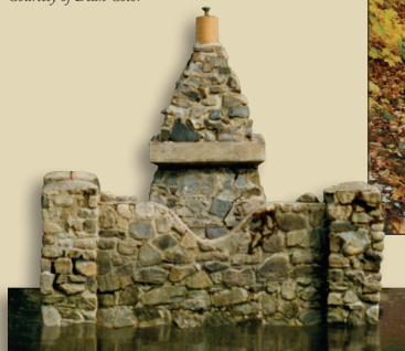
A fountain plays its waters on the Mill Pond all summer long.