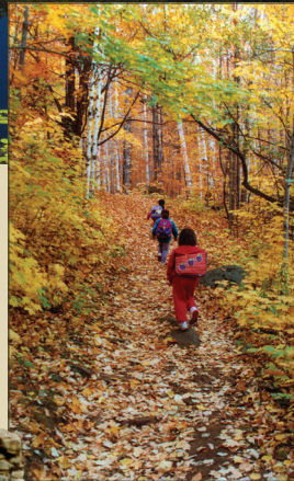
Trails in the Lake George Wild Forest appeal to hikers of all ages.