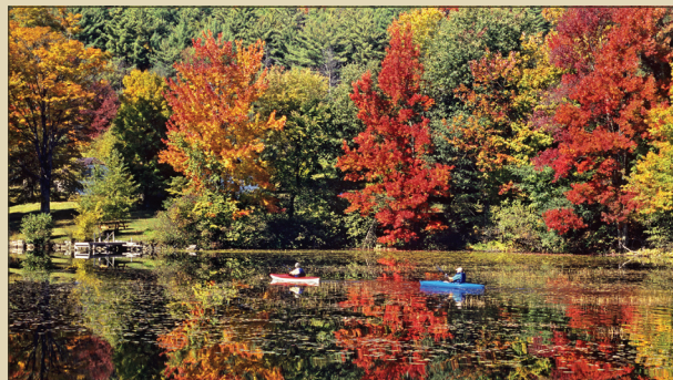
Kayakers explore the outlet of Brant Lake.