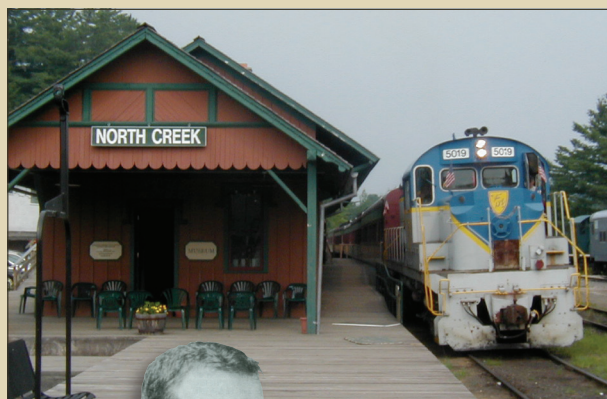
Scenic Train Rides along the majestic Hudson River.