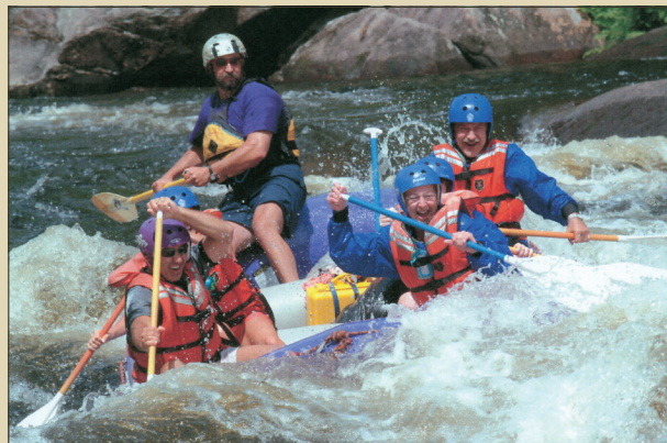
Whitewater rafting on the mighty Hudson River, Spring, Summer & Fall.