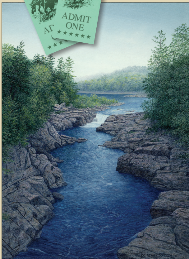
Peaceful August Morning. Painting of Rockwell Falls (formerly Little Jessup Falls)