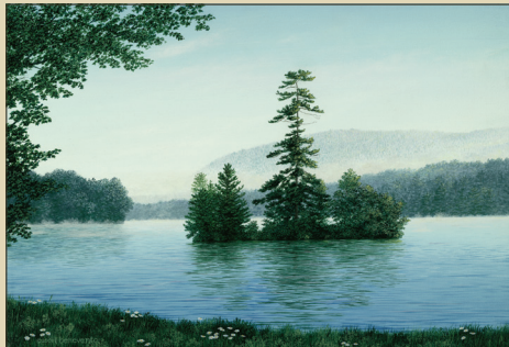
A New Day. Painting of Icy Island courtesy of Lynn Benevento