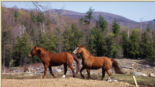
Spring on the Rayder Family’s “North 40” invites a frolic in the pasture.