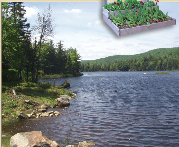
Lens Lake offers access to pristine waters for fishing and a silent retreat.