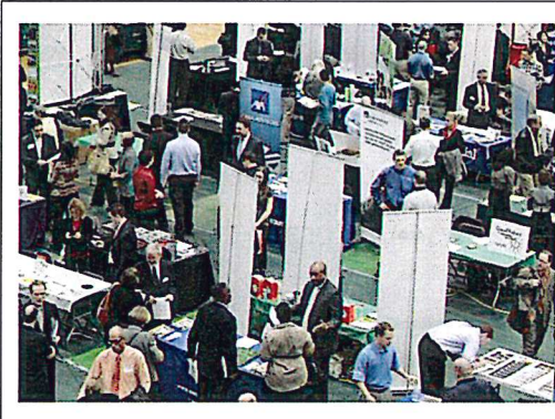
Job fairs and workshops are offered regularly at the Warren County Career Center.