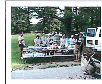
Operation Food Chain participants

A youth customer earned her high school equivalency diplo-