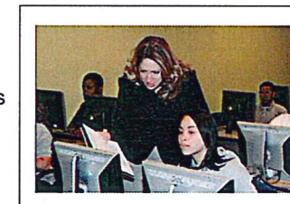
On-line training available at the Warren County Career Center.

ceive course recommendations for over 300 skill tracks and use the new skills to directly link to real-time job openings. Training can be completed in the comfort of your own home or here in the Career Center. The program