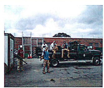
Youth Work Crew loading up at the Municipal Center.

writing and other topics suggested by the workers. The program concluded in Sept. with plans to resume in May 2018.