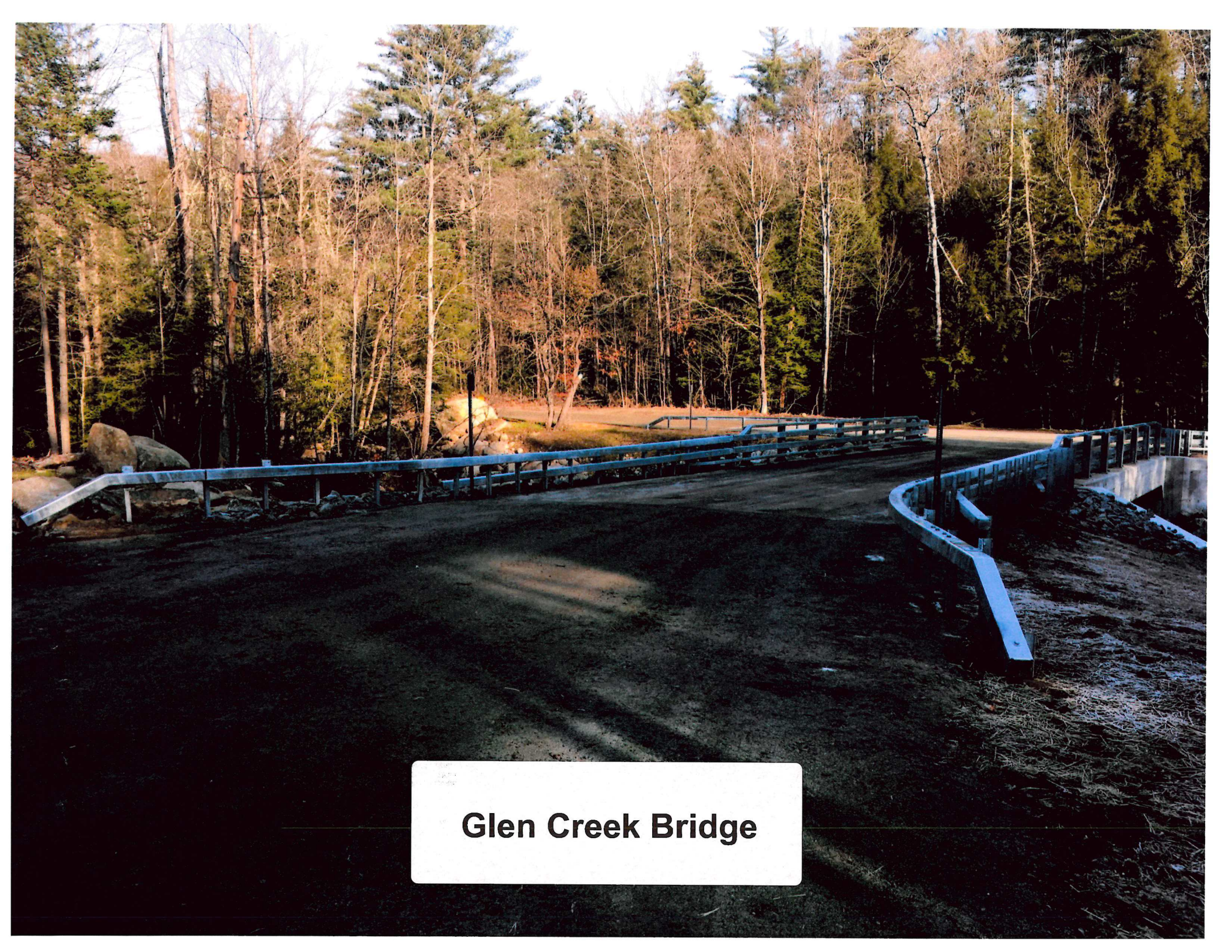
Glen Creek Bridge